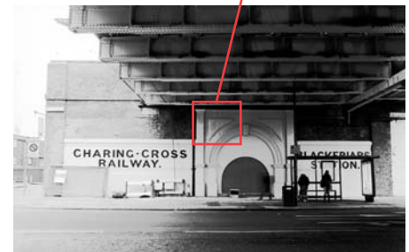
top: Technical Pan bottom: ORTHO 25